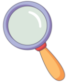
10. magnifying glass