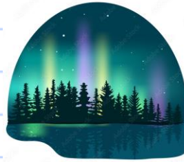
11. aurora borealis